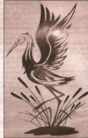
This is a picture of a "dancing heron," one of the metal creations made by artist Sandy Starbird of Wales.